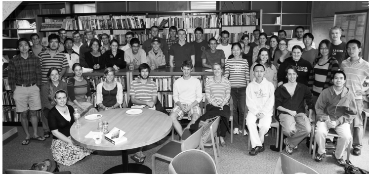
A group of Math seniors at the start of the fall semester colloquium

paper accepted this year to the Journal of Algebra on her work with affine Deligne-Lusztig varieties, and she gave many invited research talks around the eastern part of the continent, including at the workshop on "Affine Schubert Calculus" at the Fields Institute in Toronto. She also attended a workshop at the Banff International Research Station in Alberta, Canada, where she initiated a research collaboration in the area of quantum Schubert calculus.